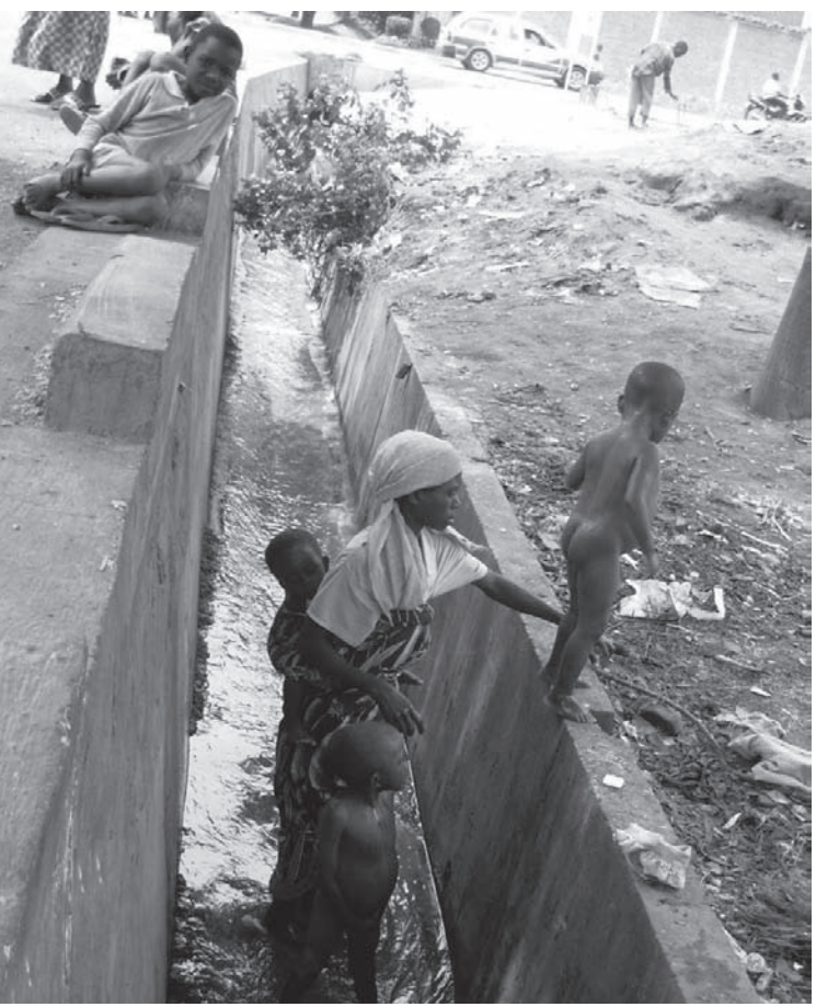
A Congolese woman asylum seeker washes her children with sewer water, outside UNHCR office in Bujumbura, Burundi, August 2007

Additionally, there is little incentive for women to make environmentally sound decisions and their lack of access to credit (of which land may be required as security) hampers them from buying technologies and inputs that would be less damaging to natural resources. As providers, their willingness to eke out a bare existence despite access to agricultural resources and education on viable methods of farming may make them adapt to less labour-intensive crops and practices that may harm the environment [12] and drain the water resources. These factors may lead to declining productivity increased environmental and degradation. Recognition of women as land holders and contributors to development would motivate them to protect the environment and desire to realize the full value of land in agricultural production.