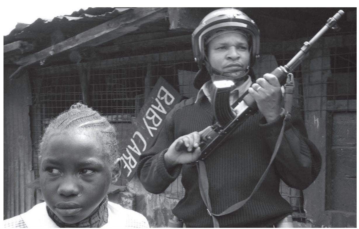
A young girl passes an anti-riot officer in the sprawling Mathare slums, Nairobi, Kenya, July 2007. Police stepped in to break up a demonstration by residents over the disconnection of water by authorities.

The United Nations Convention on the Elimination of Discrimination Against Women (UN CEDAW, 1981) proved to be a major step forward in fostering debate and setting international standards of gender equality. Article 14 (2) calls on states to take account of particular problems faced by women and the significant role that they play in the economic survival of families. It calls for measures to eliminate discrimination against women and ensuring women's right to enjoy adequate living conditions with respect to housing, sanitation, electricity and water supply. The United Nations 4th World Conference on Women (Beijing 1995) also calls on governments to ensure that women's priorities are included in public investment programmes for economic infrastructure such as water and sanitation, electrification etc.